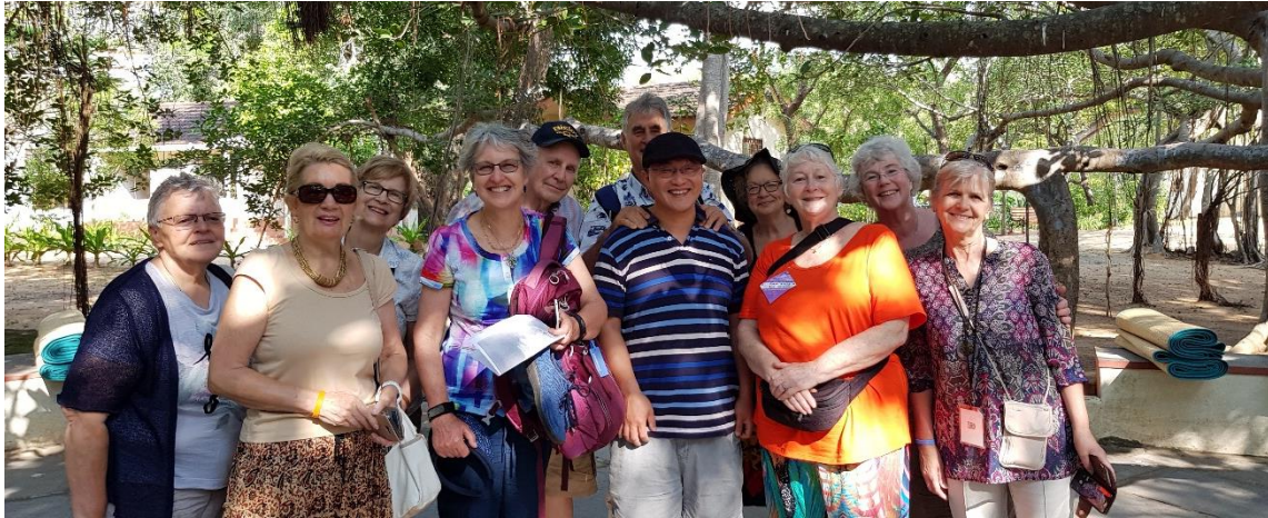
Part of the Australian Group in Adyar