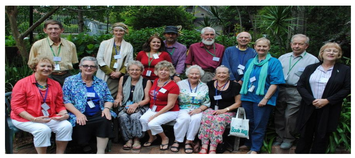
Queensland delegates at the Sydney conference