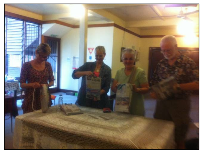
There'll be news from other TOS groups when they send their annual reports in the New Year.

you're coming to the TS Convention in Brisbane, you'll receive one of the bags to carry purchases from the bookshop.