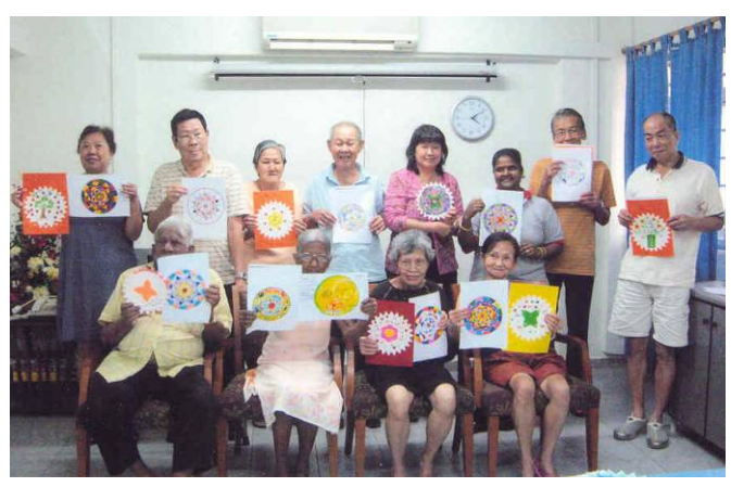
Residents of the AWWA Home in Singapore with their artwork from a colour therapy workshop.

AWWA Home is part of the Asia Women's Welfare Association that's dedicated to provide "a helping hand" to those in need in the community.