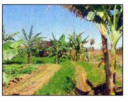
Orphanage vegetable garden

If your group or individuals decide to support this or any other international welfare activities. cheques can be sent to the TOS in Australia so that bank charges are minimised by sending an aggregated cheque or funds transfer. All sources of donations are acknowledged in the covering letter to the relevant international TOS group.